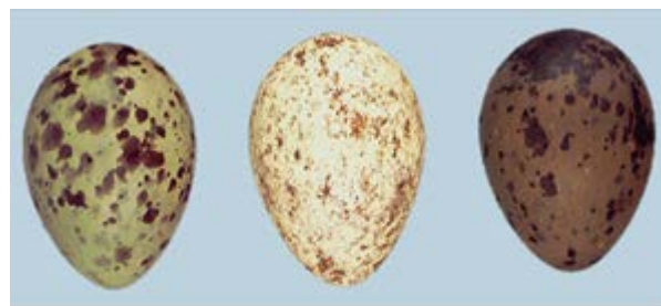
Fig. 1: Color varieties of herring gull eggs (Optimedia 1998)

The base shell color of the fusiform, circa 70 x 49 mm sized egg of the herring gull is usually light olive green, green or auburn, but can vary from whitish blue to deep rubiginous (Fig. 1). Most of the often black, dark brown or olive drab spots or dots are developed. An irregular scribble is unusual. Moreover, dense markings and scanty mottling occur. Eggs without markings are uncommon (Harrison 1975).